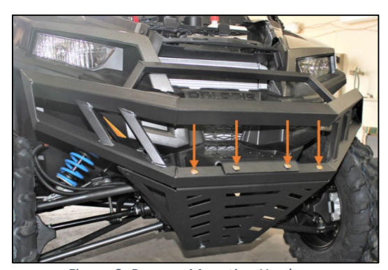
Figure 8: Bumper Mounting Hardware

7. Attach the face of the bumper to the skid plate and the winch plate. This will bring all of the parts of the bumper together.