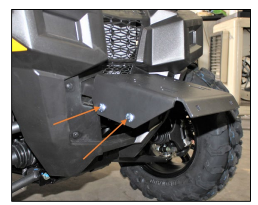
Figure 5: Winch Plate Mounting Hardware

4. Attach the winch plate to the winch bracket mounts.