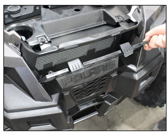
Figure 3: Top Grille Removal

Attach the winch plate mounts to the machine using the factory bumper mounting holes using the factory hardware retained in step 1.