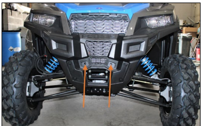
Figure 1: Factory Mounting Locations

1. Remove factory bumper (if equipped) and retain the factory hardware for later use. If the machine is not equipped with a factory bumper, utilize the hardware provided in the hardware kit to complete the installation.