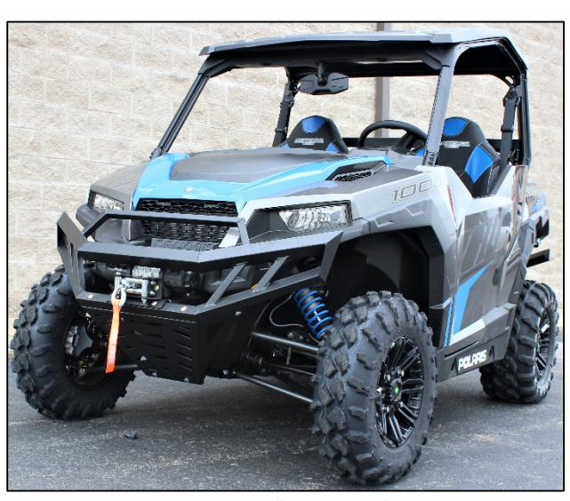
Figure 9: Installation Complete

8. Once the entire assembly is in place, tighten all hardware securely.