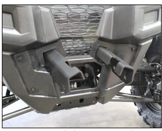
Figure 4: Winch Plate Mounting Brackets

Attach the winch plate mounts to the machine using the factory bumper mounting holes using the factory hardware retained in step 1.