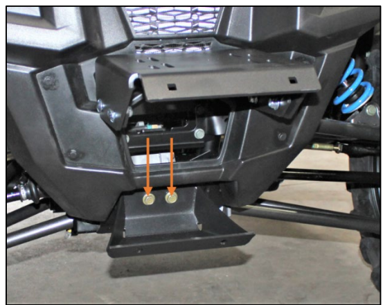
Figure 6: Lower Skid Plate Mounting Hardware

5. Attach the bottom skid plate to the lower mounting holes.