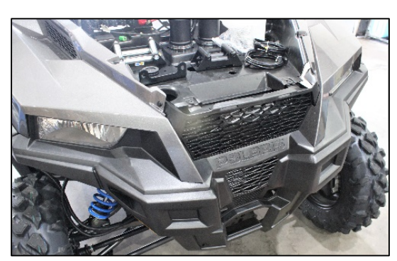
Figure 2: Hood Removed

2. Remove the hood and upper grill insert.