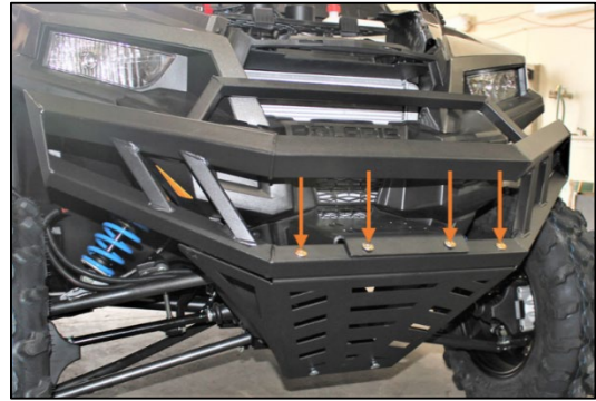
Figure 8: Bumper Mounting Hardware