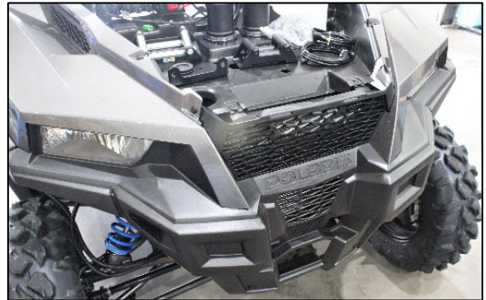
Figure 2: Hood Removed