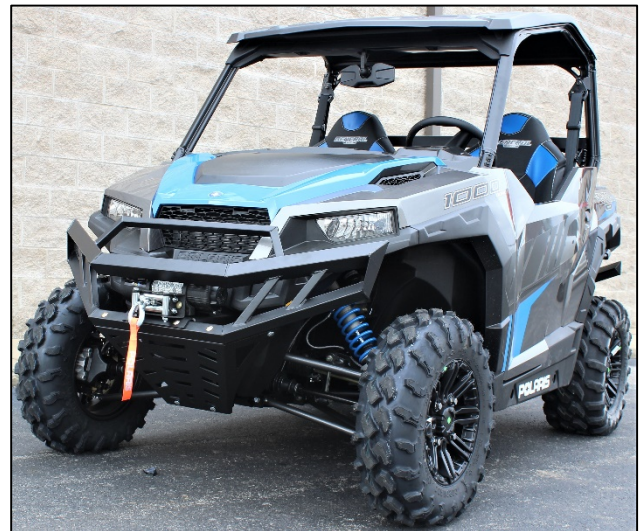
Figure 9: Installation Complete