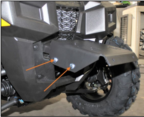
Figure 5: Winch Plate Mounting Hardware