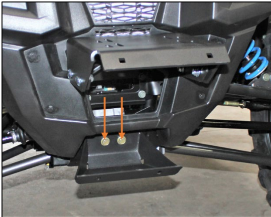
Figure 6: Lower Skid Plate Mounting Hardware