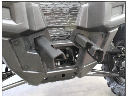
Figure 4: Winch Plate Mounting Brackets