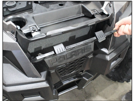
Figure 3: Top Grille Removal