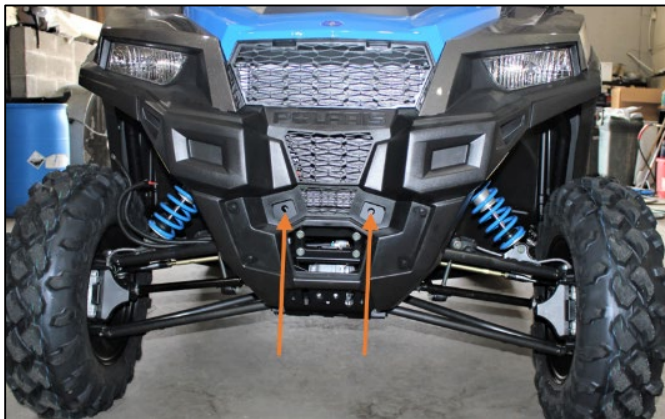
Figure 1: Factory Mounting Locations